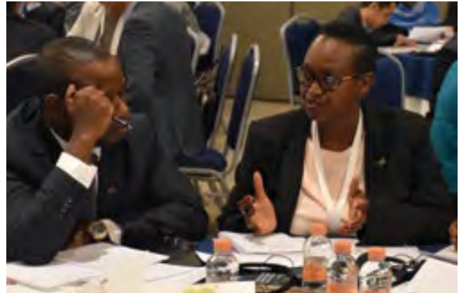
The 15th Consumer Empowerment and Market Conduct (CEMC) and 17th Financial Inclusion Data (FID) Working Group meetings in Merida, Mexico (March 2018).