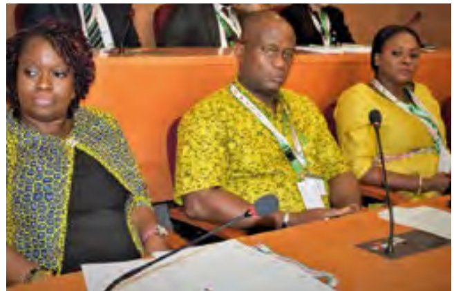
AFI Peer Advisory Service on Implementing National Financial Inclusion Strategies hosted by the Central Bank of Nigeria in Abuja, Nigeria (March 2018).

Yet, worldwide, the representation of women at the leadership level in central banks and ministries of finance remains limited. According to the Official Monetary and Financial Institutions Forum (OMFIF) 2017 Global Public Investor Gender Balance Index, only 6.5% of the world's central banks (12) are headed by women, which have seen a decreasing trend since 2016, where 15 central banks had a female Governor. 12 Its 2018 Gender Balance Index highlights that the score of central banks on the index dropped from 31% last year to 19% this year, "indicating that there are even fewer women in senior roles." 13