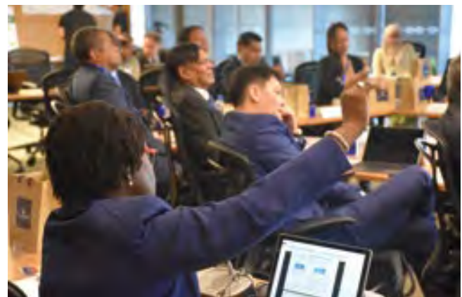
High Level Joint Learning Program on building an inclusive MSME Financing Ecosystem in Kuala Lumpur, Malaysia (April 2018)..

A majority of the respondents who participated in the study were female. A more equal representation of both females and males would have culminated in more robust findings. There were also observed inconsistencies between the responses collected from the online survey and those provided during the phone interviews, which were concluded to be due to varying levels of understanding of the issues at hand. These however, were addressed by seeking clarification either through follow-up telephone discussions or email correspondence with concerned respondents. Differences in the way each AFI member categorizes the designation of their staff members affected the quality of data, particularly when measuring the ratio of women’s representation at different levels of staff, which required follow-up clarifications from respondents. Insights from human resource staff would have added value to the findings. Finally, institutional gender diversity as a topic of discussion and area for policy action is noticeably still new for AFI members, who intuitively seek to address immediate challenges to the financial inclusion of women rather than social structures that prevent gender-sensitive policymaking.