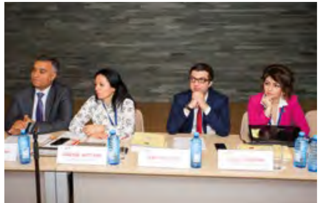
AFI Joint Learning Programme on Consumer Protection: Enhanced Market Conduct Regulation and Supervision for Financial Inclusion hosted by the Central Bank of Armenia in Dilijan, Armenia (March 2018).