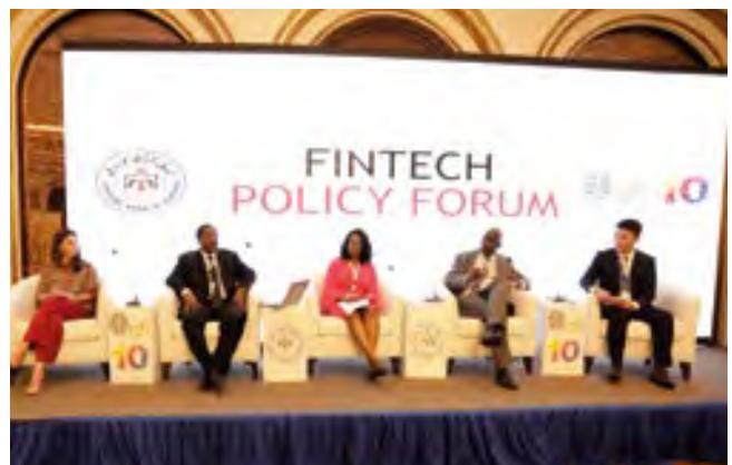
FinTech Policy Forum co-hosted by Central Bank of Jordan and AFI in Amman, Jordan (April 2018).

This special report demonstrates that a growing number of AFI members recognize this and in consequence, have leadership that actively advocates and asserts the importance of gender diversity to gender-sensitive financial inclusion policymaking.