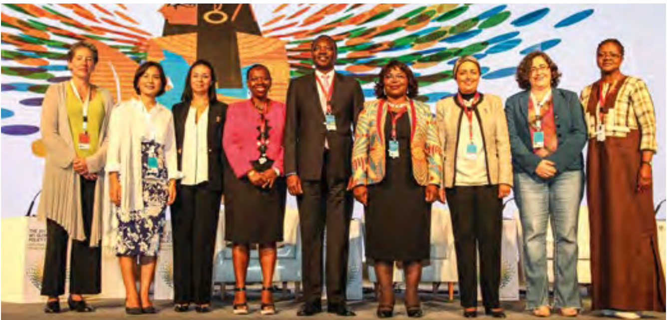
Members of the AFI Gender and Women Financial Inclusion Committee (GWFIG) with Governor Zandamela from Bank of Mozambique during a panel discussion at the 2017 Global Policy Forum.