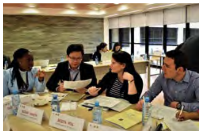
Participants at the AFI Joint Learning Programme on Consumer Protection: Enhanced Market Conduct Regulation and Supervision for Financial Inclusion hosted by the Central Bank of Armenia in Dilijan, Armenia (March 2018).

In more general policymaking, studies demonstrate that "women in positions of leadership in parties, governments, or national legislatures have been shown to focus on issues of interest to women, bringing them into the public policy arena." 23 This is evident in the experience of the Bank of Zambia, Central Bank of Egypt, Central Bank of Jordan, and the National Bank of Rwanda, which all have women in leadership positions who champion and drive the reformulation and development of financial inclusion policy and regulation that more meaningfully target women. In the case of Jordan, the Central Bank's ability to maintain a good level of gender diversity within its staff has translated into gender-responsive financial product design and even advocacy on the part of the financial institutions that it regulates.